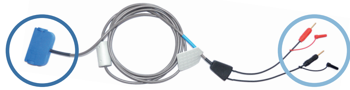
Distal Side (Female) Connection Myocard-Electrode/ Catheter