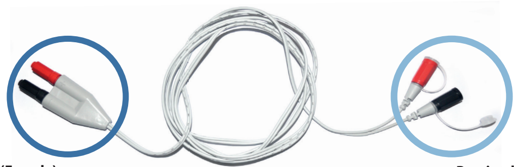
Distal Side (Female) Connection Myocard-Electrode/ Catheter